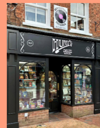
Shop Front Grant