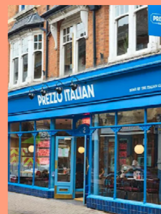
High Street Rental Auctions

We have also supported nine shops to improve their appearance through shop front grants, and we're rolling out a further scheme in early 2026. We also launched town centre business support grants and a business rates scheme to further support businesses.