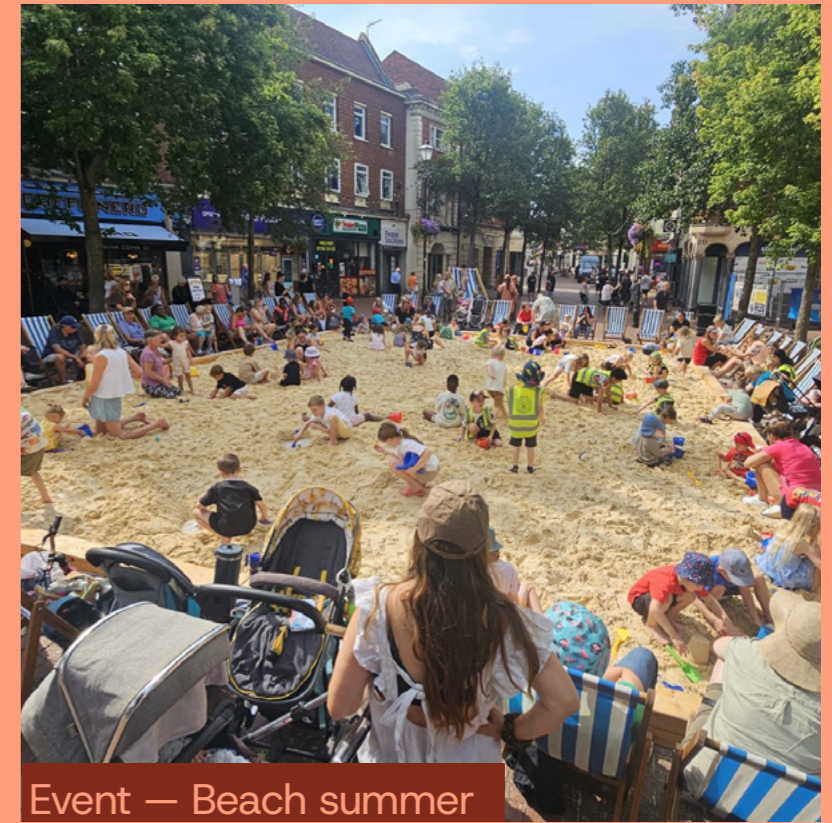
Event — Beach summer

As a result of the increased investment in events the footfall in the town centre is up 10% on the previous year.