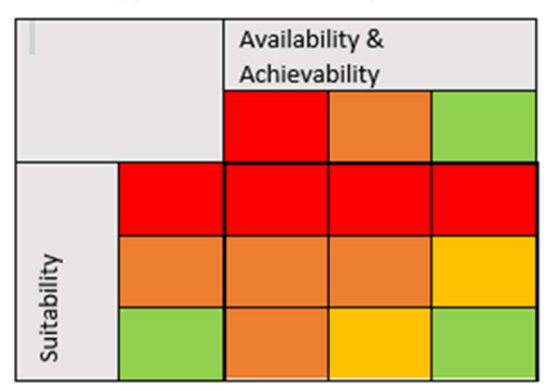
Figure 1: Example of a site assessment matrix (illustrative: each LPA would develop its own methodology for this level of detail)

3.8 To summarise: this document has been prepared jointly to ensure a consistent shared approach to identifying and assessing sites for housing and employment uses, which will be used by each Local Authority (or alliance of Local Authorities where shared plans are developed) as the framework within which they will develop their detailed assessment and selection processes.