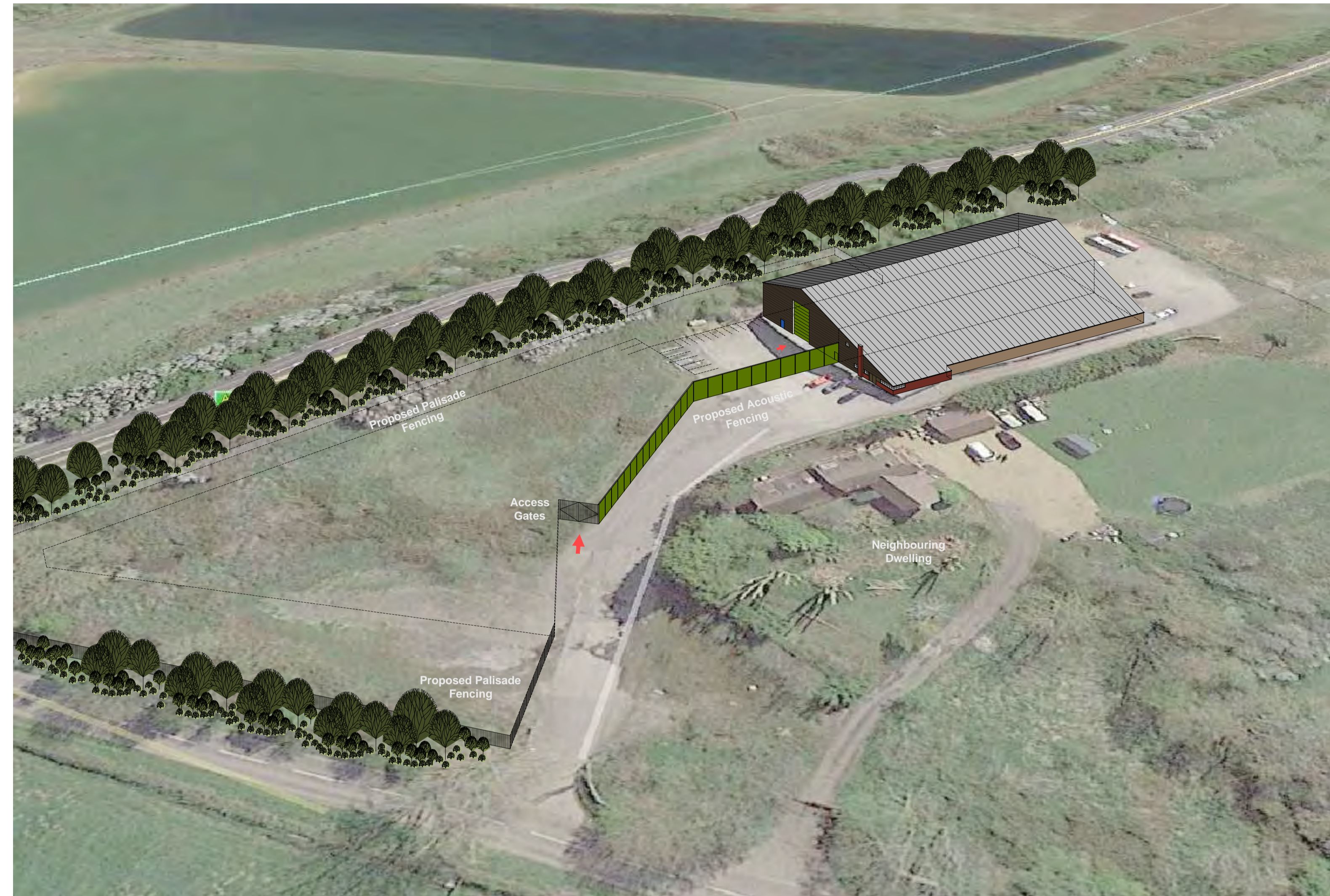
EXTENT OF ACOUSTIC FENCING