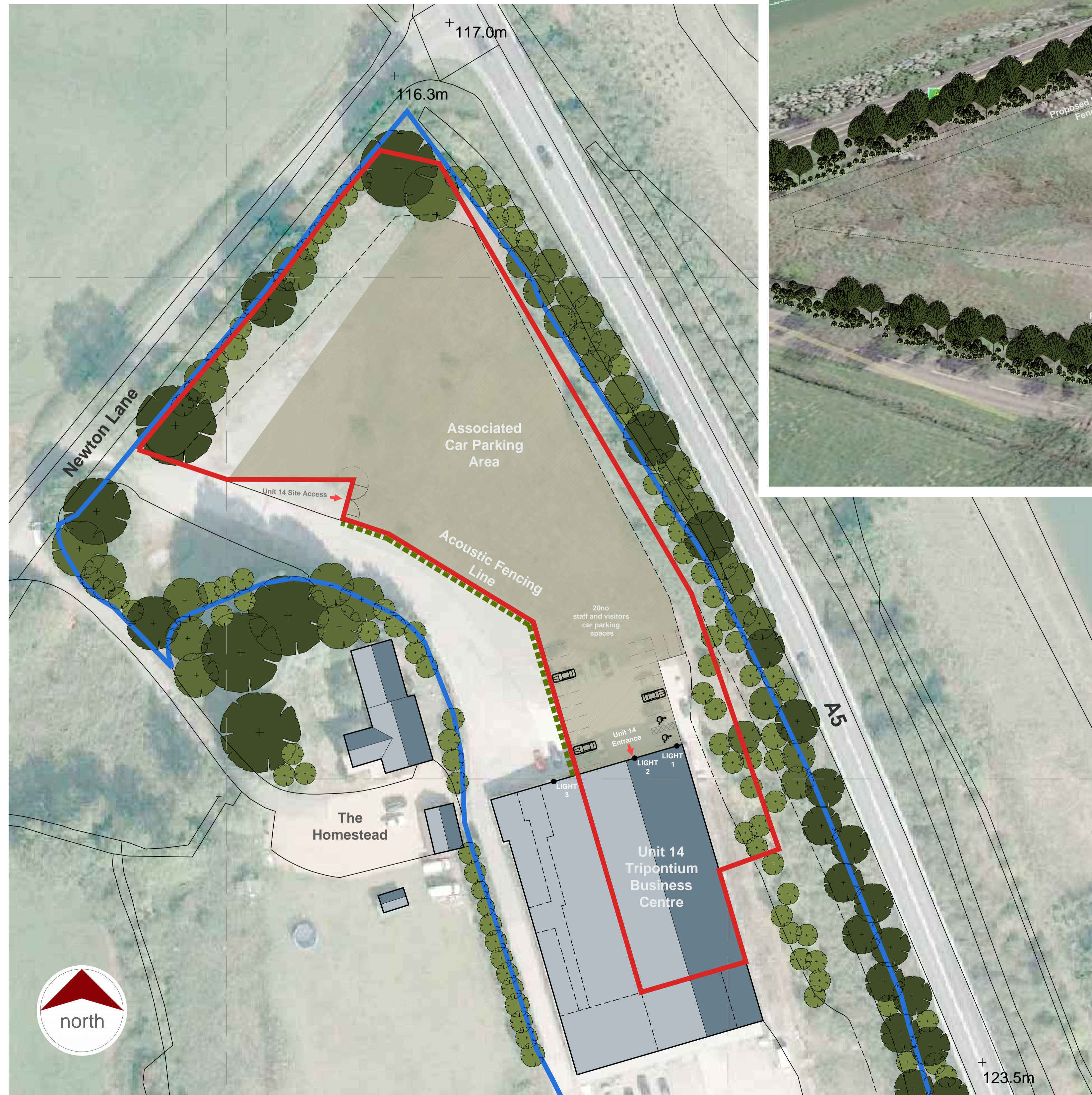
SITE LAYOUT 1:500 @A1