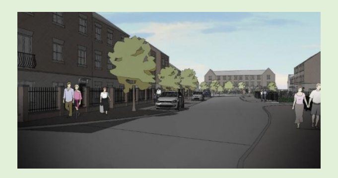
(artist's impression of new parking spaces on Stonechat Road)

a) Stonechat Road (maximum 7 car parking spaces)