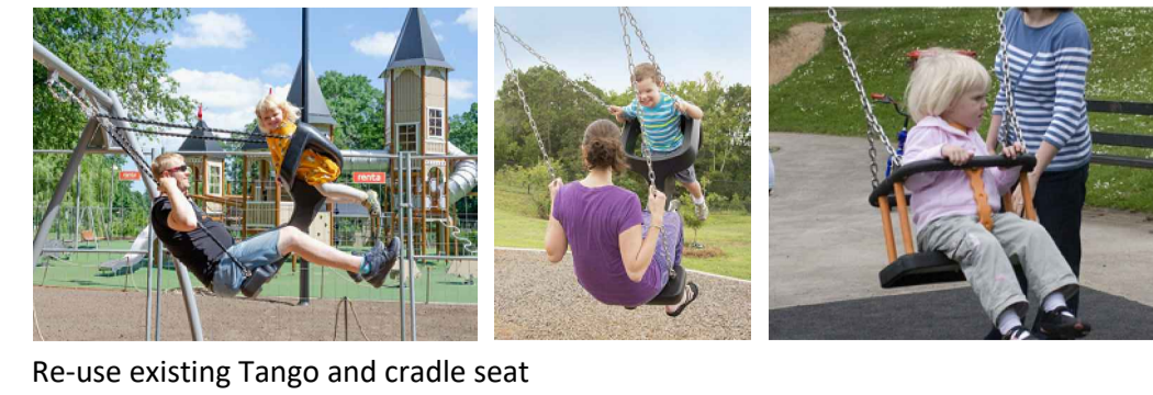
Re-use existing Tango and cradle seat

6 New Metal Climbing Frame with Slide for Juniors Replace existing multiplay unit with a new climbing frame with slide for older children aged 5 years +. New unit to provide a range of more challenging climbing and sliding activities.