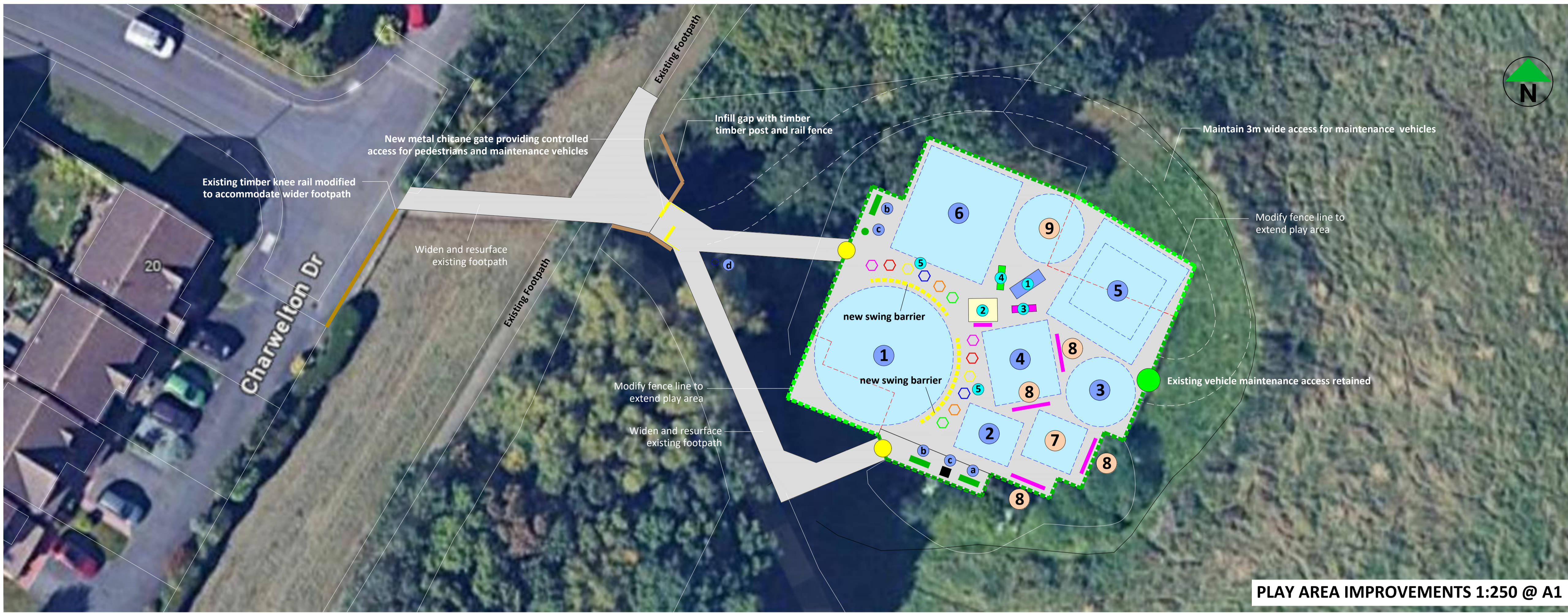
PLAY AREA IMPROVEMENTS 1:250 @ A1

PSGA (Ordnance Survey) AC0000813826 © Rugby Borough Council 2024